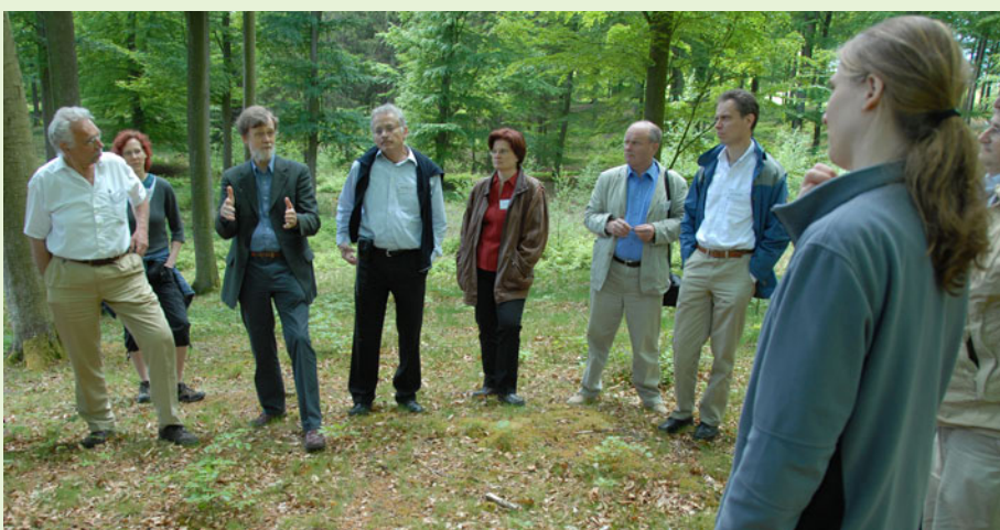
Teachers as pupils, discussing activating learning methods in the forest during the SILVA Network conference in Copenhagen 2008.